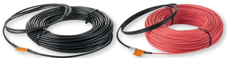
Example of product design